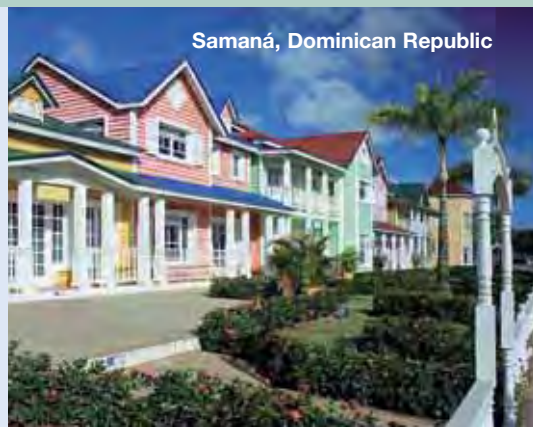
Samaná, Dominican Republic