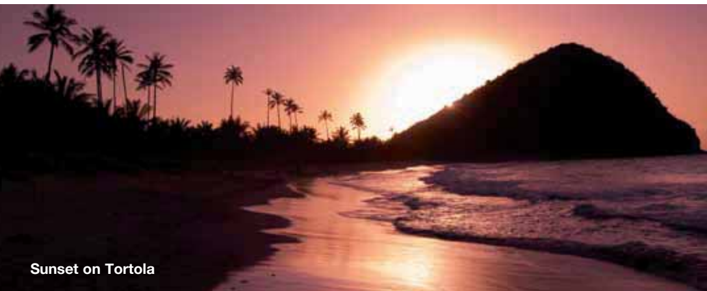
Sunset on Tortola