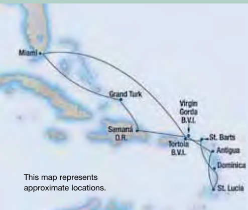
This map represents approximate locations.