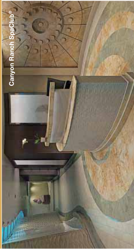
Canyon Ranch SpaClub®

2-FOR-1 CRUISE FARES AND FREE AIRFARE IF BOOKED BY JUNE 18, 2010