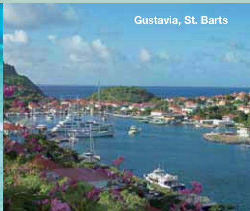
Gustavia, St. Barts