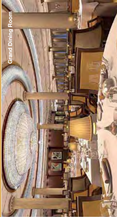
Grand Dining Room