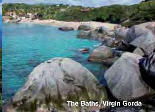
The Baths, Virgin Gorda